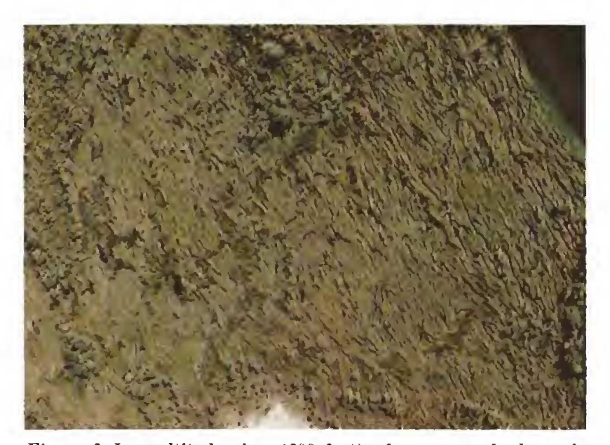
Figure 6. Low altitude view (600 feet) of same marsh shown in Figure 5. Note flattened plants of Juncus roemerianus and Spartina alterniflora as a result of wave action across island.